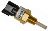
ULS-200 Solid-State Level Sensor