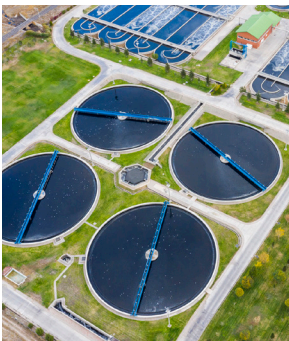
Water & Wastewater